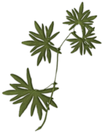
1918 Cadillac got 'Best of Show.'