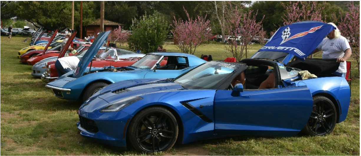
9 Cars from NCoCC attended this car show.